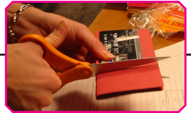
You can learn a lot from a very simple prototype

To manage the solution-building process. Identifying a variable also encourages you to break a large problem down into smaller, testable chunks.