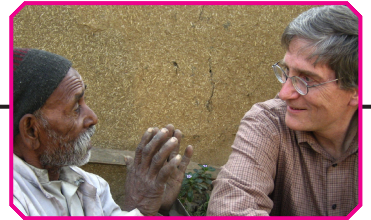
In empathy work, connect with people and seek stories

Engaging with people directly reveals a tremendous amount about the way they think and the values they hold. Sometimes these thoughts and values are not obvious to the people who hold them, and a good conversation can surprise both the designer and the subject by the unanticipated insights that are revealed. The stories that people tell and the things that people say they do—even if they are different from what they actually do—are strong indicators of their deeply held beliefs about the way the world is. Good designs are built on a solid understanding of these beliefs and values.