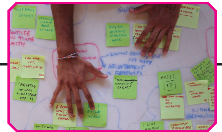
Maximize your innovation potential