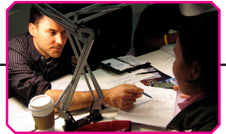
The key to user testing is listening .

To refine your POV. Sometimes testing reveals that not only did you not get the solution right, but also that you failed to frame the problem correctly.